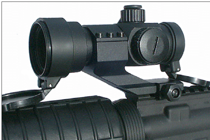
S.P.O.T. Cantilever 30mm Scope Mount

IMPORTANT: READ THESE MATERIALS BEFORE YOU USE THIS PRODUCT